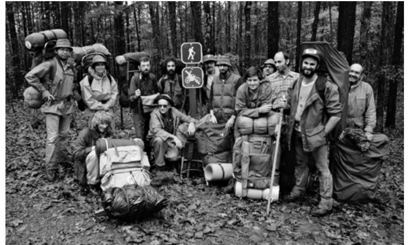
History in the making 25 years ago: The very first OHTA overnight hike (above); and our first work trip (below)